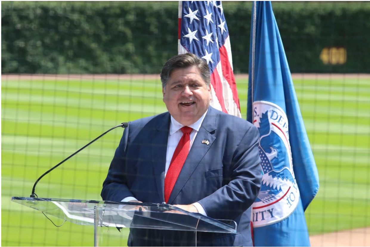
Above: Governor Pritzker; Below: Chief Judge Pallmeyer